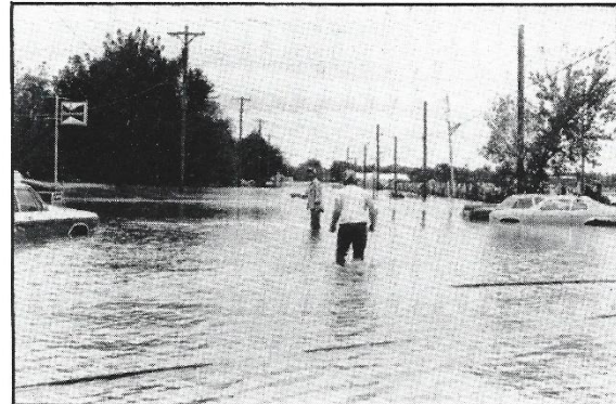
Jerry Simmons 02-1

Building back Our homes Building back Fort Scott