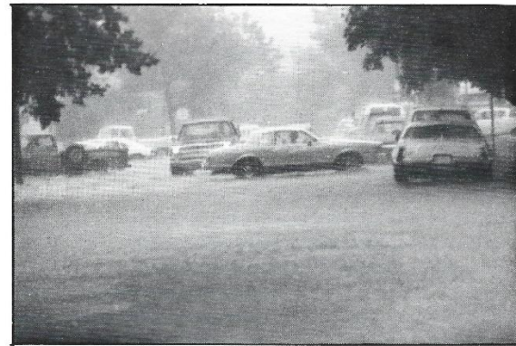
Melissa Albers 03-17

All night Then morning No sunshine Just rain