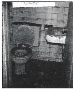
Lucile Young 59-37