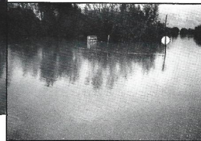
Ran Balin 56-34