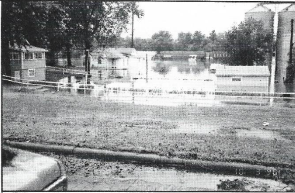
Chuck Elliott 58-50