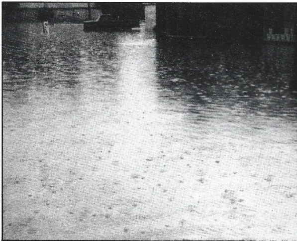
Betty Walker 48-2

All night Then morning No sunshine Just rain