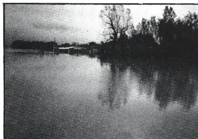
Ran Balin 56-33