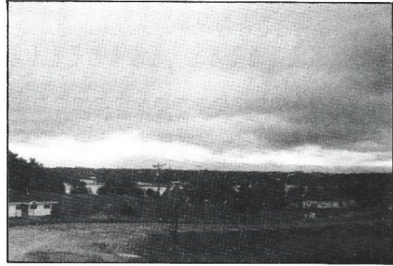
Clarence Nation 38-70

Gray sky Black night Leaden dawn Damp day