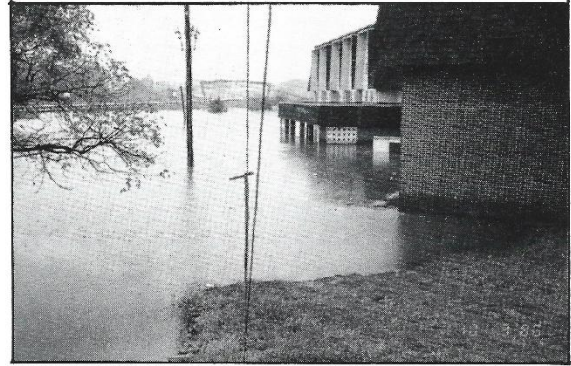
Chuck Elliott 58-27