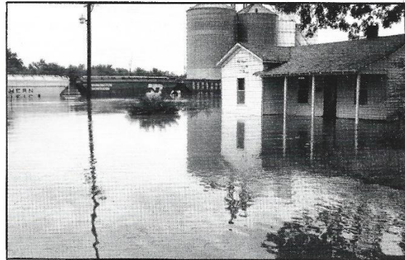
Chuck Elliott 58-49