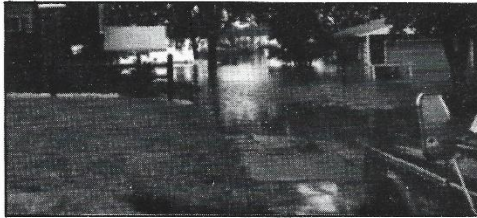
Lucile Young 59-34

Then strength Grows anew Helping neighbors Saving lives